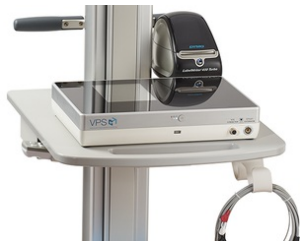
VASONOVA VPS G4 TRAY FOR GCX CART