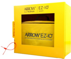
EZ-IO(R) Wall Mounted Storage Cabinet