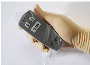
VASONOVA VPS G4 REMOTE