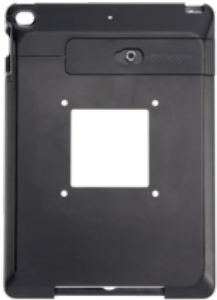
VPS G4 (TM) Interface Case