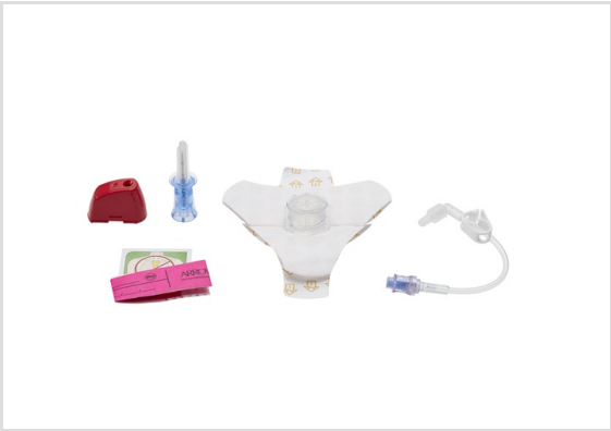
Representative photo(s): actual product specifications may vary from that shown in the photo