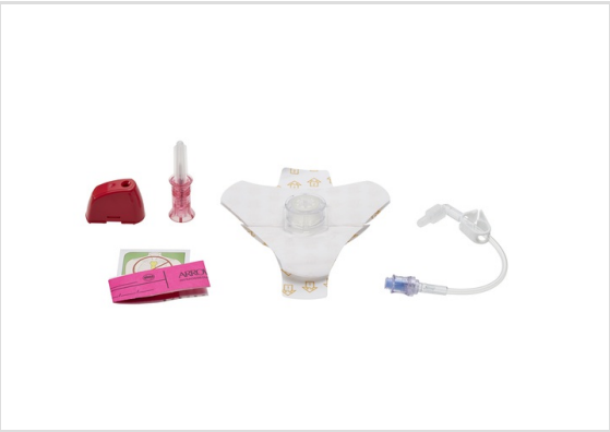
Representative photo(s): actual product specifications may vary from that shown in the photo