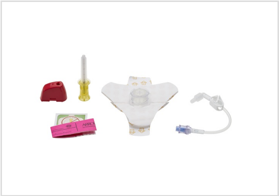
Representative photo(s): actual product specifications may vary from that shown in the photo