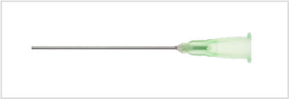
Representative photo(s): actual product specifications may vary from that shown in the photo