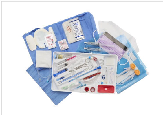
Representative photo(s): actual product specifications may vary from that shown in the photo