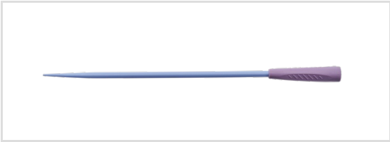
Representative photo(s): actual product specifications may vary from that shown in the photo