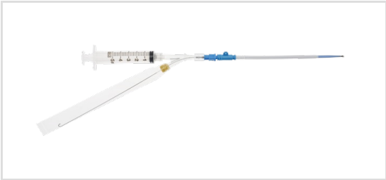
Representative photo(s): actual product specifications may vary from that shown in the photo