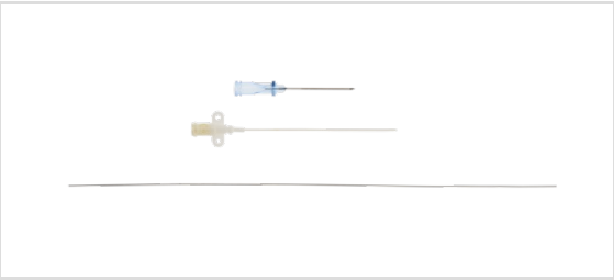
Representative photo(s): actual product specifications may vary from that shown in the photo