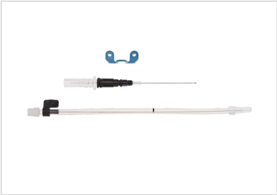
Representative photo(s): actual product specifications may vary from that shown in the photo