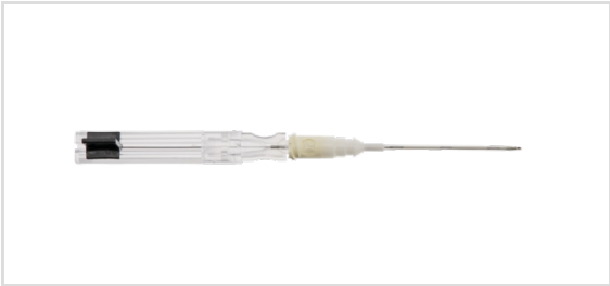
Representative photo(s): actual product specifications may vary from that shown in the photo