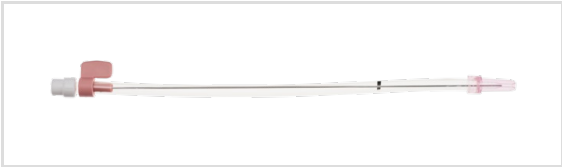
Representative photo(s): actual product specifications may vary from that shown in the photo