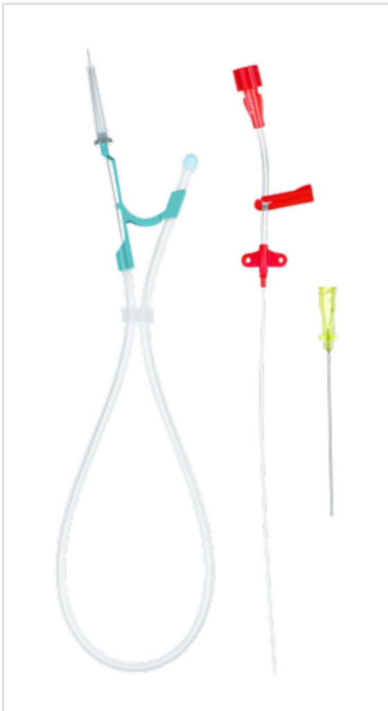
Representative photo(s): actual product specifications may vary from that shown in the photo