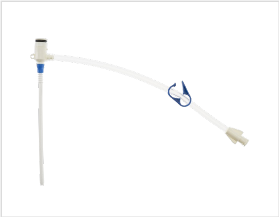
Representative photo(s): actual product specifications may vary from that shown in the photo