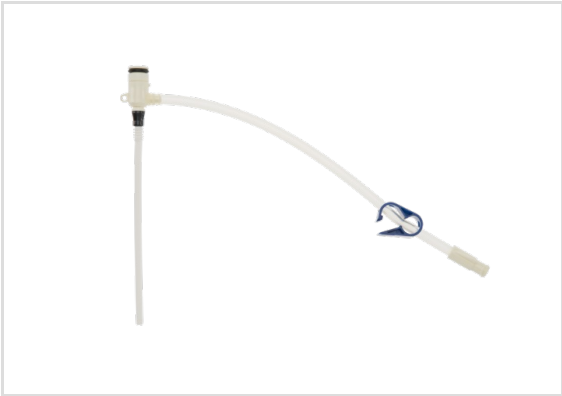
Representative photo(s): actual product specifications may vary from that shown in the photo