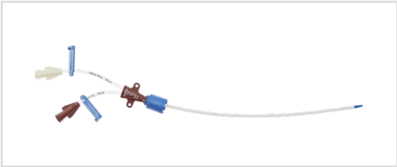
Representative photo(s): actual product specifications may vary from that shown in the photo

Two-Lumen CVC for use only with Arrow Percutaneous Sheath Introducer (8.5 Fr. and 9 Fr.)