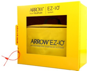
EZ-IO(R) Wall Mounted Storage Cabinet