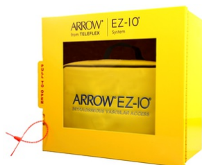
EZ-IO(R) Wall Mounted Storage Cabinet