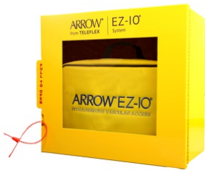
EZ-IO(R) Wall Mounted Storage Cabinet