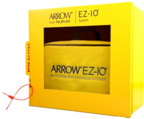
EZ-IO(R) Wall Mounted Storage Cabinet