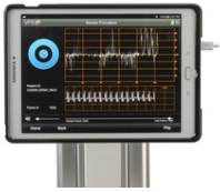
VASONOVA VPS G4 CONSOLE/ACCESSORIES