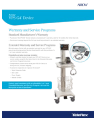
VASONOVA VPS G4 SERVICE/WARRANTY (2YR)