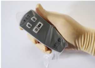
VASONOVA VPS G4 REMOTE