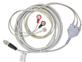
VPS ECG LEADS (3-LEADS)