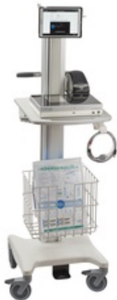
VASONOVA VPS G4 CART GCX