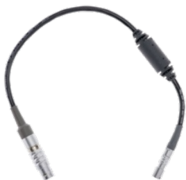
VASONOVA VPS G4 STYLET EXTENSION CABLE